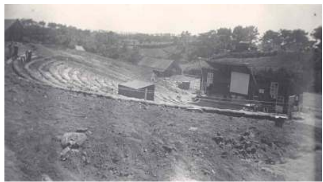
Jakes Bowl - the outdoor theater - during construction, May 1945