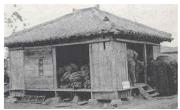
First temporary post office, Camp Makibaru