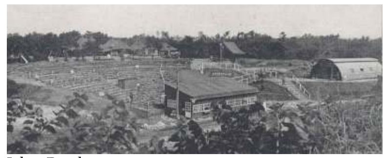
Jakes Bowl, summer 1945

The 130<sup>th</sup> Battalion was also the first to have an amphitheater and, thanks to our chaplain who had the right connections, the first to show nightly movies. One of Washing Machine Charley's last visits was in the middle of a musical movie being shown. They did not even turn off the projector. But some of the less hardy souls left their sandbag seats. Yours truly didn't budge.