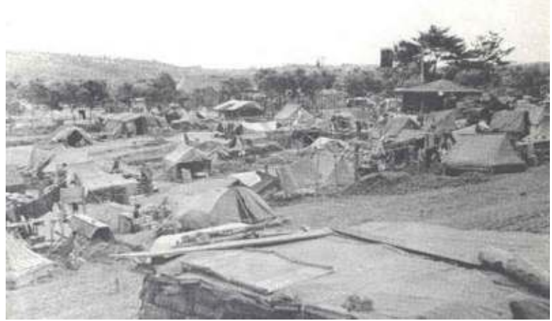
Camp Makibaru April 25, 1945