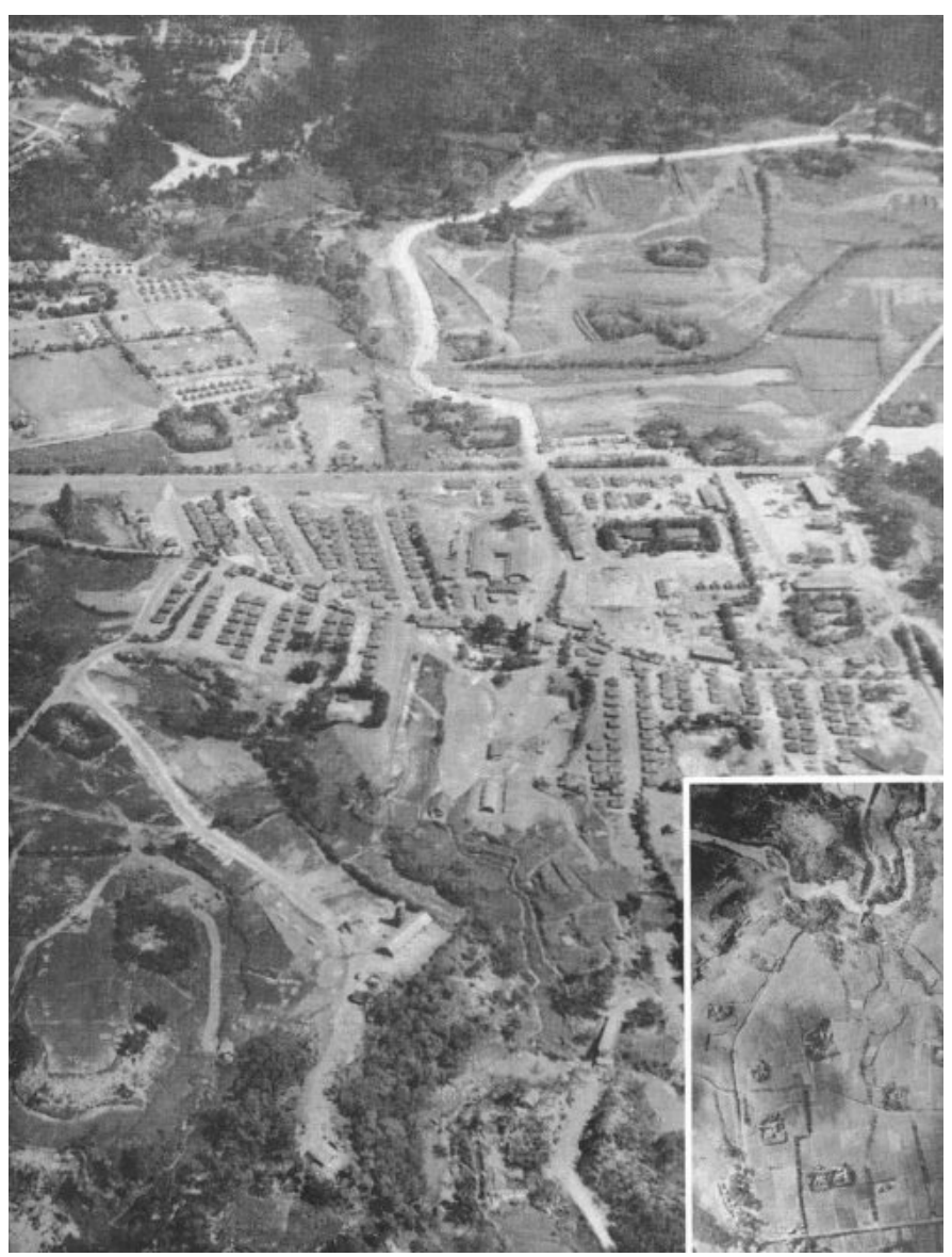
Aerial view of Camp Makibaru ca summer 1945