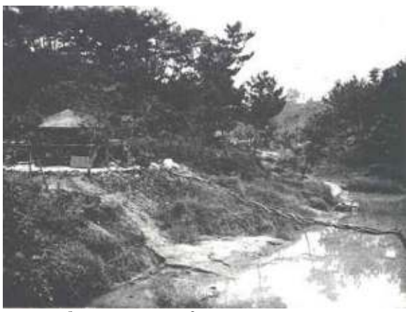
Pump house view from river