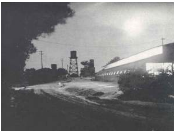
Mess hall, night scene

I again became chief of my watch in the galley. I don't know if mine was the "port watch" or the "starboard watch," Navy lingo designating the two shifts. The first few weeks we handed out mostly C-rations, etc. But in no time supplies were flowing in.