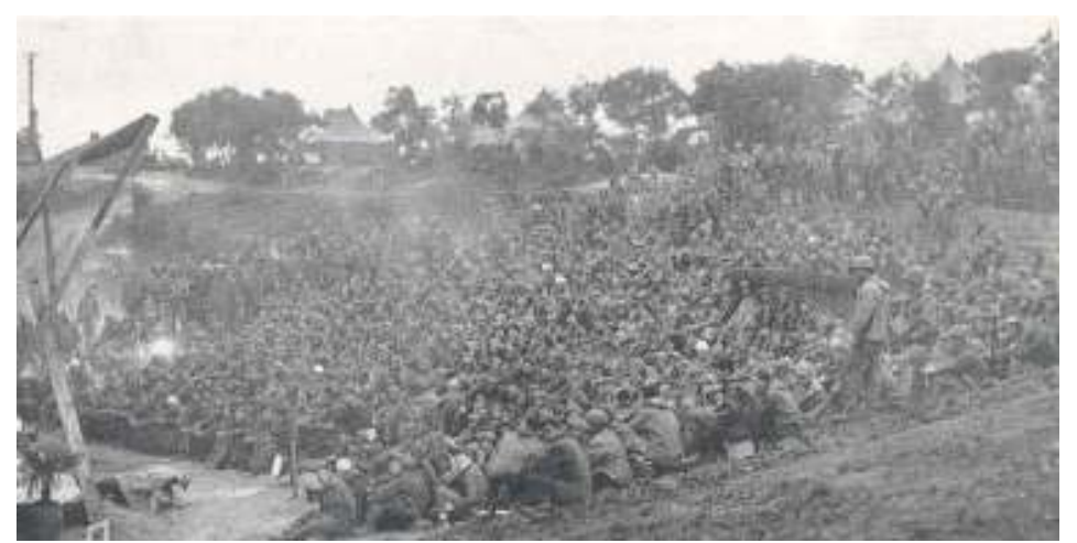
Jakes Bowl dedication, evening of May 29, 1945