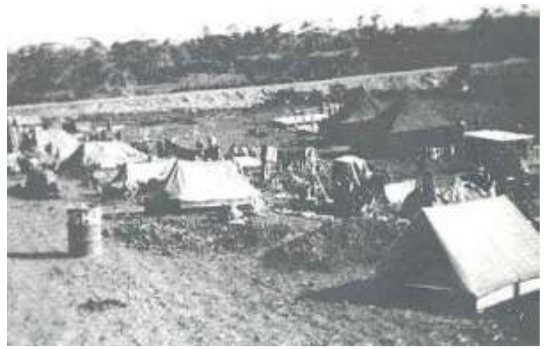
Camp Makibaru tents May 1945