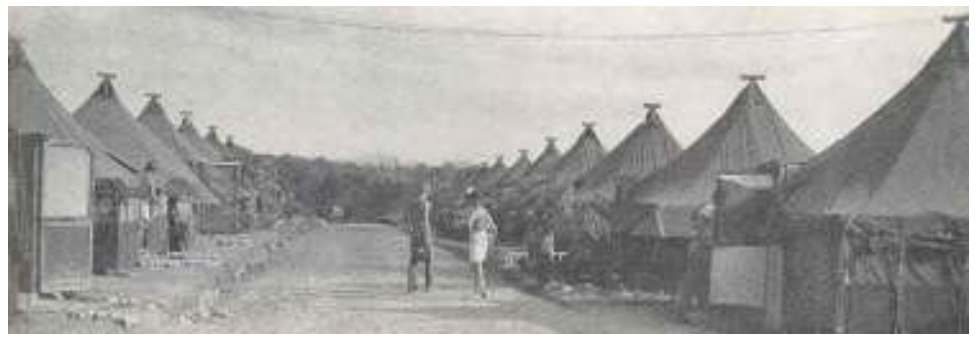
Makibaru Street Scene, 1945