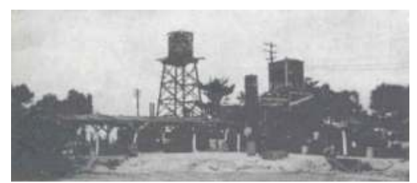
Makibaru water tower and distillation unit

The next few photos pertain to our camp water supply the source of which was the Bishi Gawa River. This river was also known as the Bisha Gawa River, but is referred to in both ways by the Seabees. I have chosen to use the Bishi Gawa for purposes of this historical record. The Battalion memory book states, "Upon arrival at Okinawa, another subdivision was added to the department [mechanical department on the 130<sup>th</sup> NCB construction organization chart], the camp water plant. River water was pumped 800 feet from the Bisha Gawa to the water purification plant where it was discharged into 3,000-gal. Tanks to provide flocculation and prechlorination. After standing quietly for 45 minutes, a chemically formed floc (white, fluffy, precipitate) settled on the bottom, taking with it the dirt, impurities, and other foreign matter in the water. The water was then discharged through sand and gravel filters, and additional chlorine was added. A distillation plant was operated as a subsidiary. It provided additional water, steam, and hot water for showers."