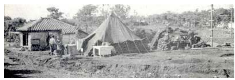
Camp Makibaru Command Post April 1945