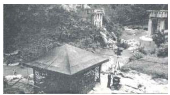
Pump station for camp water supply, Bishi Gawa

Our work included building and improving roads and bridges, extending and building runways and related facilities at Yontan airfield, putting up Quonset buildings such as Lt. General Jimmy Doolittle's quarters and staff buildings, building "Radio Okinawa" whose slogan was "A stone's throw from Tokyo," - just to name a few activities. We were one of five Seabee battalions on the island, which were organized into the 44<sup>th</sup> Naval Construction Regiment. Secondarily and as time and resources permitted, our construction swabbies would build up and improve living conditions at Makibaru.