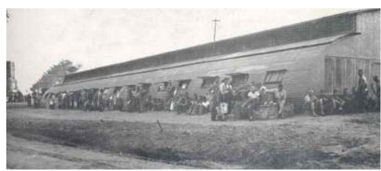
Mess hall, Camp Makibaru