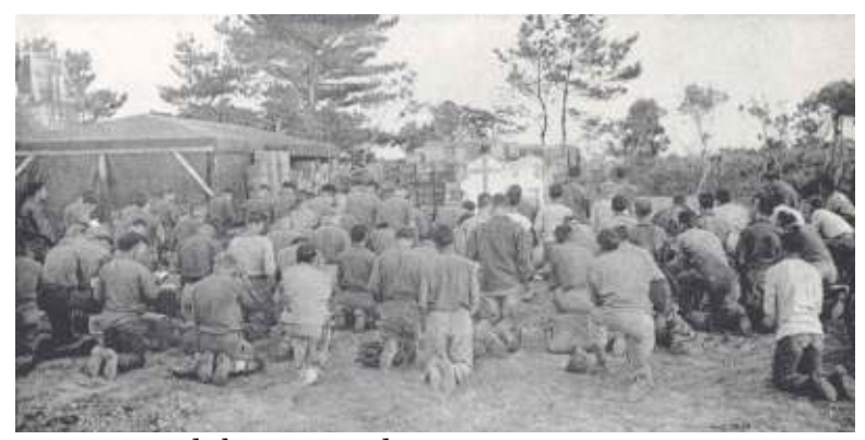
Mass at Makibaru, April 1945

Our tent, shown above, was located behind the amphitheater and facing the street. Note how we improved the place with palm trees and pine trees. The little white picket fence made it seem real homey.