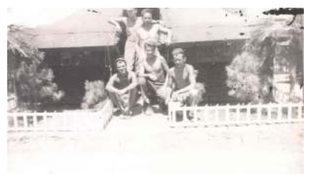
My tent and mates, 1945

Our tent, shown above, was located behind the amphitheater and facing the street. Note how we improved the place with palm trees and pine trees. The little white picket fence made it seem real homey.