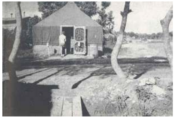
Permanent post office, Camp Makibaru