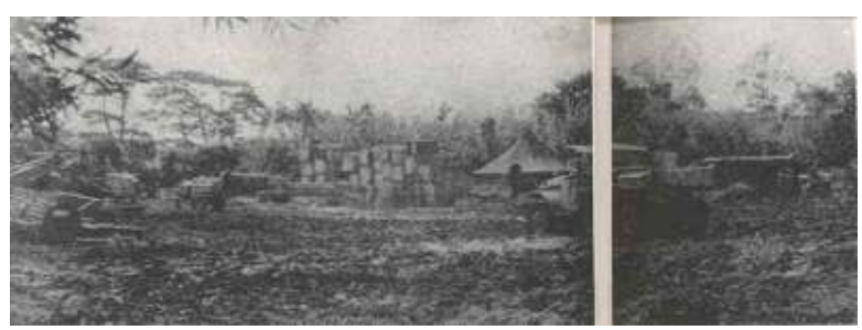
Camp Makibaru April 14, 1945