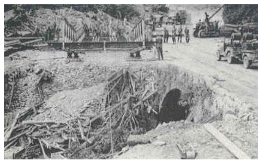
Bailey Bridge construction