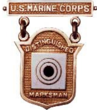
USMC Distinguished Marksman's Badge 1920s - Present

percentage of Non-Distinguished shooters competing in authorized “Leg” or “Excellence in Competition Matches.” Over the years the criteria for winning a Leg Medal have changed from the top 12 competitors in a Divisional or Departmental Match to the top