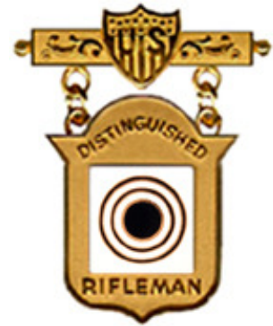
DCM/CMP Distinguished Badge 1959 - Present

While the Marines didn't approve issuing a Distinguished Pistol Badge until 1920, it is interesting to note that the Marine Pistol Leg medals (a legacy from the U.S. Army), even today depict a pair of pistols on their E-I-C Badges that more closely resemble the 1905 Colt Automatic than the M1911 (evidenced by the lack of an apparent manual/thumb safety and a more abrupt "grip-to-slide angle"). This may be simply a case of bad artwork, but on the other hand, the old badges with the stylized semi-automatic pistol may have been an attempt by the Army shooting community to second-guess the Ordnance Corps on the eventual adoption of a semi-automatic