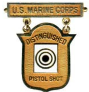
U.S. Marine Corps Distinguished Pistol Badge 1920 – Present

It would appear that in 1903 the Army decided to issue a badge simply marked Distinguished Pistol Shot , (the revolver being simply a “revolving pistol”). The new badge, now to be called the Distinguished Pistol Shot Badge was to be similar in design to the Distinguished Marksman’s Badge, but would be 5/6ths the size of the rifle badge.