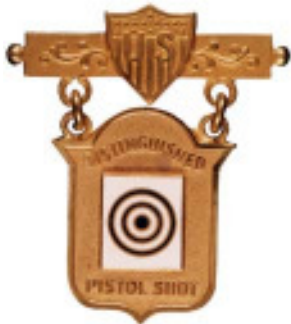
Army Distinguished Pistol Badge 1903-1959 DCM/CMP Badge to Present

Distinguished Pistol Shot attaining this distinction in 1894... but he is the ONLY individual so named. Research continues in this matter, and it may well be that the lone Distinguished Pistol Shot was awarded the badge retroactively, much as many of the awards of International Distinguished Badge were awarded many years after their becoming eligible for the badge. Every other Distinguished Pistol Shot in the 1926 document is listed with a date of 1903 or later for his award.