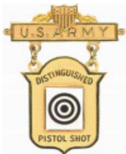
U. S. Army Distinguished Pistol Shot Badge 1959 - Present

Service Pistol. You must remember that the 1905 Colt was one of the initial contenders for consideration as the new service weapon prior to John Browning's final refinements. It is at least possible that the artwork for the new E-I-C badge was accomplished prior to final decision of the Ordnance Folks on which new pistol was to receive the nod. Considering the fair resemblance of the 1905 to the M1911, they may simply have decided to leave well enough alone. This is of course, simply speculation, but the pistols on the Marine Corps Leg Medals very closely resemble the 1905 Colt.