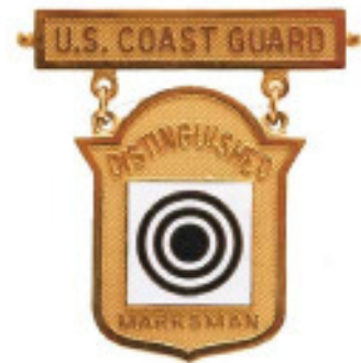
U.S. Coast Guard Distinguished Marksman's Badge

The designation "Distinguished Marksman" originally inscribed on the badge continued until 1959, when the U.S. Army and the DCM (now the CMP) decided to change the terminology to "Distinguished Rifleman." To those wearing the Distinguished Badge in the 1950s, the term "Distinguished Marksman" seemed a bit archaic. In the 1880s, the term "Marksman" conjured up visions of a man or woman especially skilled with a rifle. By the late 1950s the term "Marksman" usually indicated the lowest rung on the weapons qualification ladder following after Expert and Sharpshooter. When the designation was changed, the Army pushed the Adjutant's Shield up on the suspension bar slightly and added "U.S. Army" to the top bar. Aside from the Army inscription on the suspension bar, the Army and the Civilian badge remain identical. The Naval Service (Navy, Marines and Coast Guard), always a vanguard of conservatism, continued to designate their Distinguished Medal winners as "Distinguished Marksmen" , a term still inscribed on the badges issued by the Naval Service.