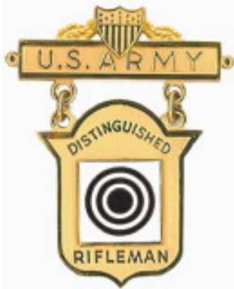
U.S. Army Distinguished Badge 1959 - Present

went with a design that more closely resembles the Army badges currently issued. Conversely, the Marines continued (and still continue) to use the earlier basic round design for both their rifle and pistol legs.