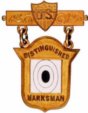
The First Distinguished Badge 1887 – 1903