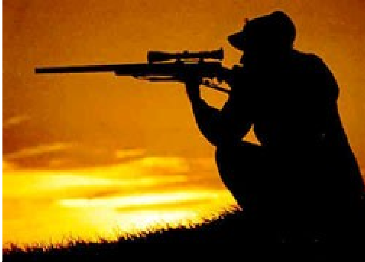
The Setting Sun on a Marine Corps Legend, Gunnery Sergeant Carlos Hathcock

I have been in on the Marine Corps Scout Sniper evolution since about 1966 when I was the S-3 of the 2 nd Reconnaissance Battalion at Camp Lejeune. I was told that the “new concept” was to establish a Sniper Platoon for each regiment (set up so each Infantry Battalion would receive a squad). This was to be supplemented with a platoon for the various Reconnaissance Battalions. Being the junior Battalion S-3 in the 2 nd Marine Division, I was called to a conference at Division Headquarters where the entire plan was to be laid out. Dear Allah! I never heard such bitching and moaning in my entire existence! Bird Colonels (Regimental Commanders) were cursing HQMC for visiting such nonsense on a “real” combat outfit. Holy Catfish